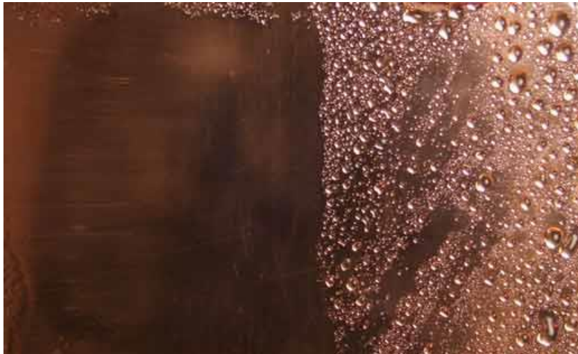
Left side is properly cleaned. Right side needs further cleaning.